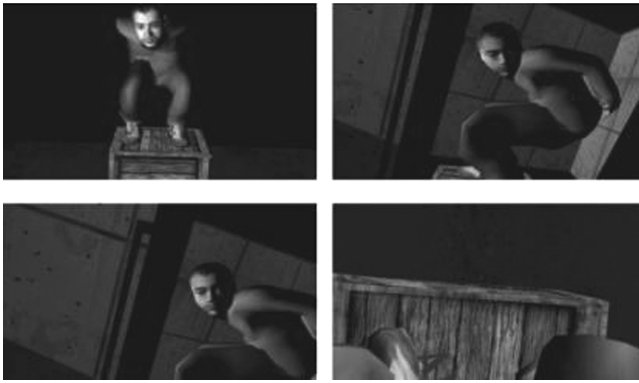
Figure 2. The virtual scene. (a) Top left: The participants at first saw the avatar from a third-person perspective. (b) Top right: After entering into the avatar perspective, they may turn their head to the right and see a reflection in a virtual mirror. (c) Bottom left: As they moved their head, the view would change, and the head of the avatar would move in synchrony. (d) Bottom right: When they looked down at themselves, they would see the virtual knees and feet corresponding to a crouched position.

ments of adjustment, and also for us to check that the belt they wore was correctly sampling their respiration. It was explained that they should move their head freely in all directions but that they must keep their body still. They were also told that they were about to be left alone in the room and that the story was that they were there in that room against their will. At that point, the experience began, with audio accompanying the introduction of the visuals (see Figure 2).